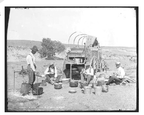
Camp wagon on a Texas roundup, William Henry Jackson 1900.

but all agree it must be cooked in a Dutch oven.<sup>1</sup> It could contain one or more of the following ingredients: beef, calf heart, calf liver, sweetbreads, calf brains, bone marrow. It was usually