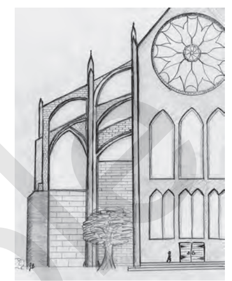
Flying buttresses. Laura Bettis.

The Gothic architectural style used flying buttresses to support the weight of the walls and the heavy roof, but that did not mean they were ugly or obtrusive. The flying buttress was decorated and designed in such a way that it added beauty and dimension to the cathedral (McNutt 40). Various curves were used to complete the exterior look of each cathedral. The architects also used these structures to