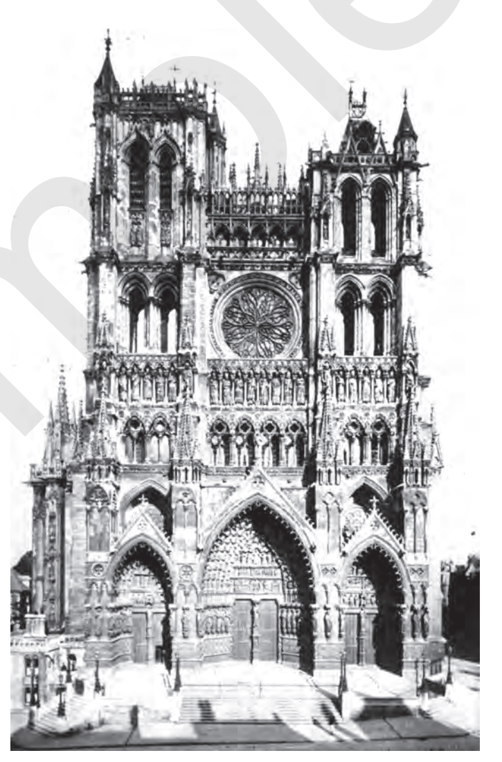
Notre-Dame d'Amiens, Gothic cathedral. Public domain.