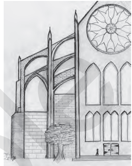
Flying buttresses. Laura Bettis.

The Gothic architectural style used flying buttresses to support the weight of the walls and the heavy roof, but that did not mean they were ugly or obtrusive. The flying buttress was decorated and designed in such a way that it added beauty and dimension to the cathedral (McNutt 40). Various curves were used to complete the exterior look of each cathedral. The architects also used these structures to direct water away from the building, and they often put a decorative gargoyle on the end of a downspout. Water poured from its mouth. Some buttresses were four tiers high, while others were a single tier. As the years went on, the different Gothic styles added more adornment to the flying buttress. Because of the style of the Flamboyant Gothic builders in the fifteenth century, pointy pinnacles were added to the tops of the columns of the buttresses (McNutt 38). They also added rows of pointed arches within the design at this time. The cathedrals often have many rows of buttresses, and some follow the rounded end of the choir and then traverse down the other side as they do at the Notre-Dame Cathedral in Paris, France. While they are needed for strategic engineering purposes, the flying buttresses also add a layer of beauty and elegance.