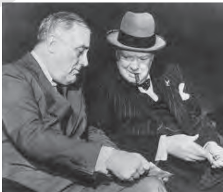
U.S. President Franklin D. Roosevelt and British Prime Minister Winston Churchill.